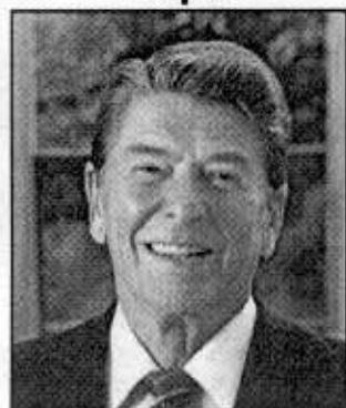
1911 - 2004 40th President and Commander in Chief of the United States of America Ronald W. "Dutch" Reagan

President Ronald Reagan's resolve in the defense of freedom helped to change the course of modern history. Among his many legacies, he restored America's pride in the men and women who wear the military uniform. This modest man of good humor had the conviction and personal courage to provide our nation and the free world with directional leadership at a time when it was so sorely needed.